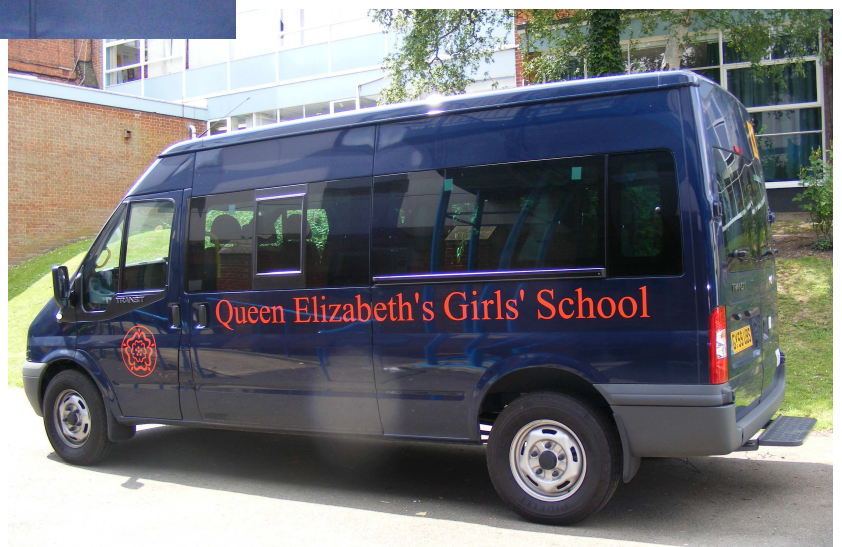
2009 QEGSA buys new mini bus