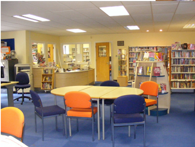
2008 Development Fund contributes to refurbishment of library, including furniture, shelving and ICT equipment