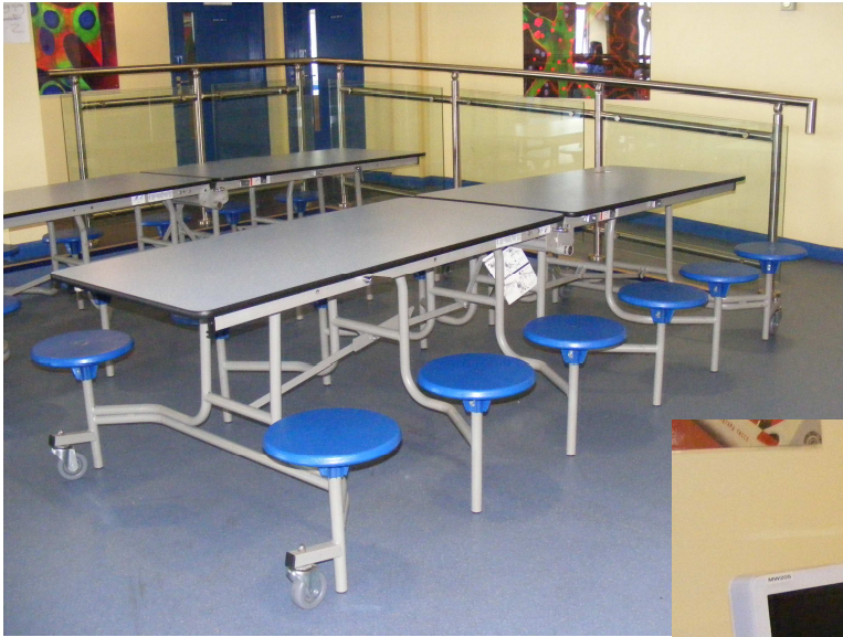
2006-7 QEGSA contributes to Dining Room furniture and Media equipment